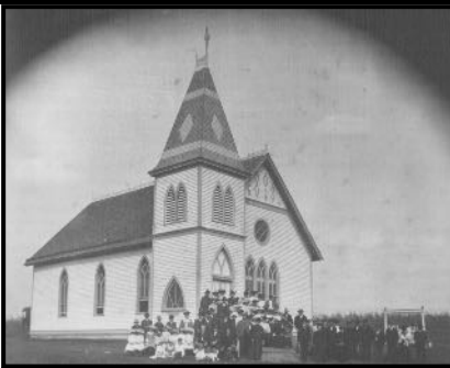
The Danish Baptist Church of Oakfield Township, Iowa, was built in 1893. The congregation moved into Elk Horn, Iowa, in 1918.